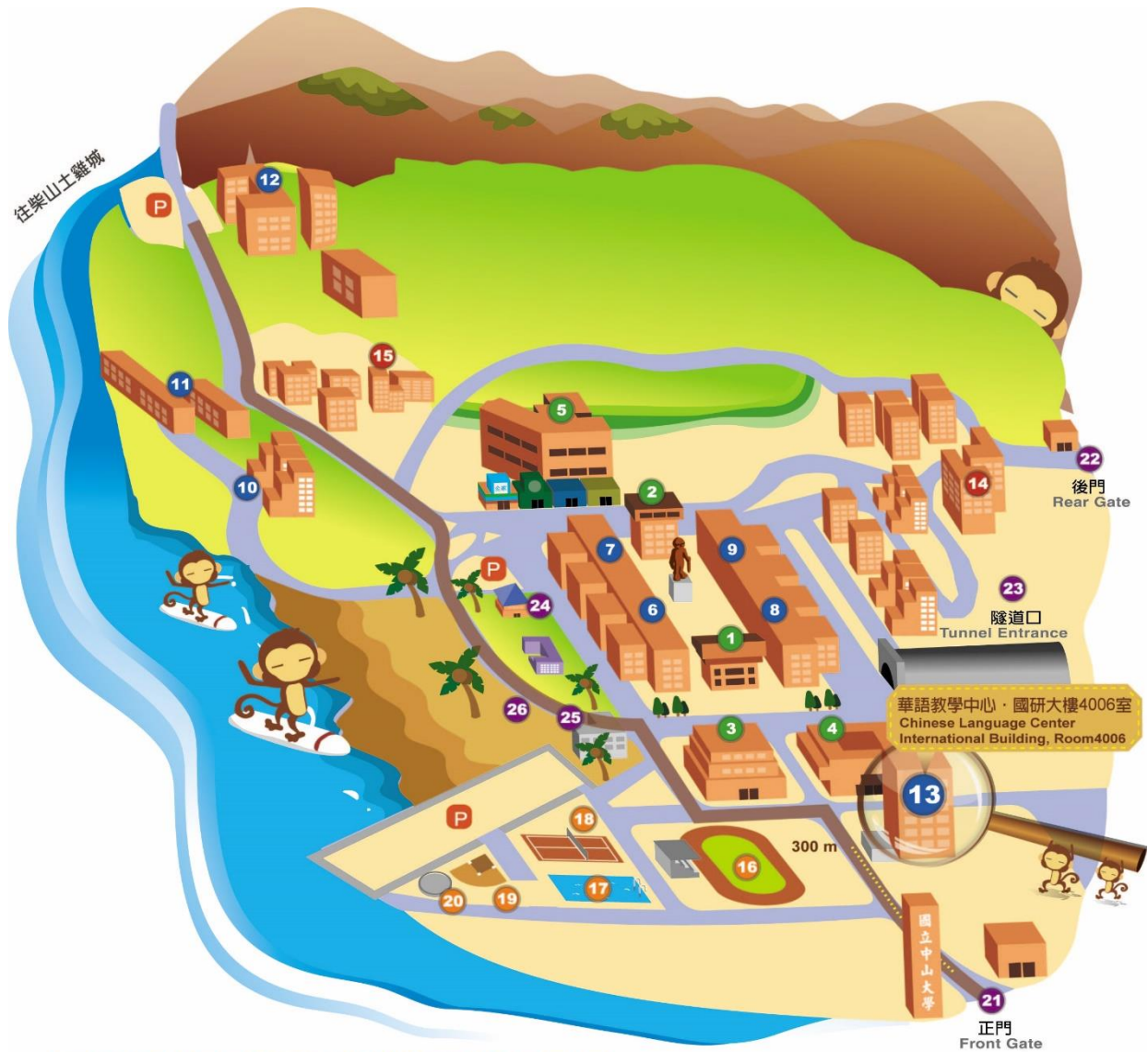
國立中山大學華語教學中心位置圖 Location of Chinese Language Center, NSYSU